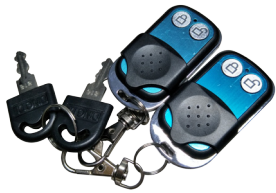
Remote control and keys